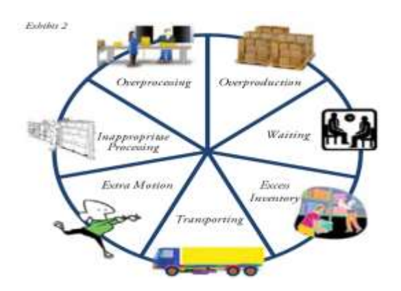
Fig. 1: Sources of Wastages in a Production System

Consuming energy, wasting people's time and using facilities to store and move around materials and work and there's the opportunity cost of delayed payment.